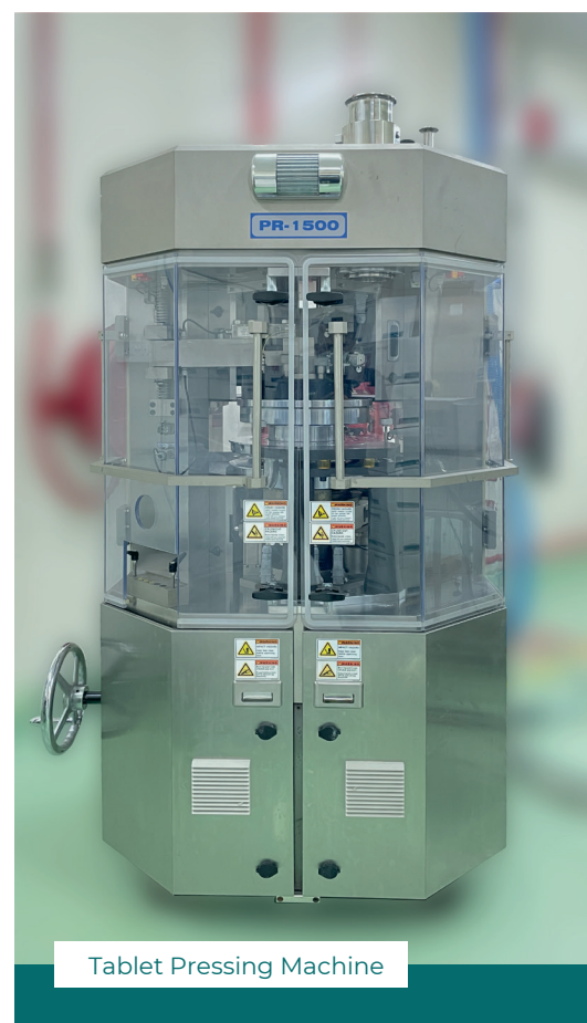
Tablet Pressing Machine

We are everywhere, all of the time. Every touch is a unique experience. We invest in the development of people and equipment in cooperation with the best experts. We perform our work conscientiously and strive to be the best in everything we do.