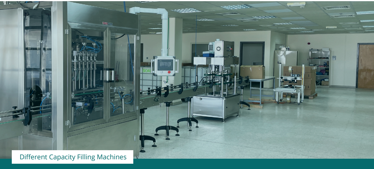
Different Capacity Filling Machines