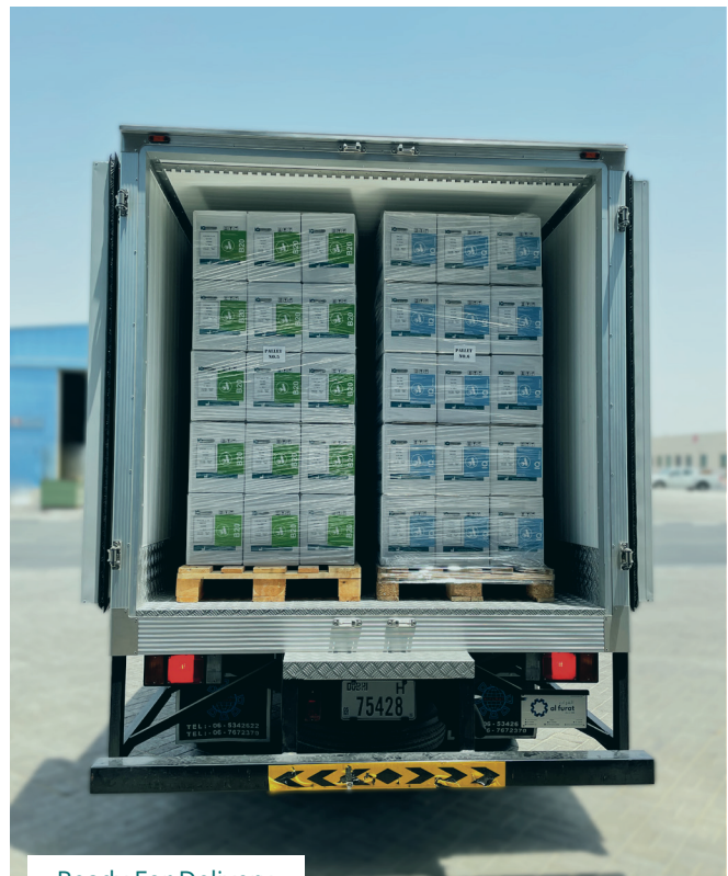
Ready For Delivery