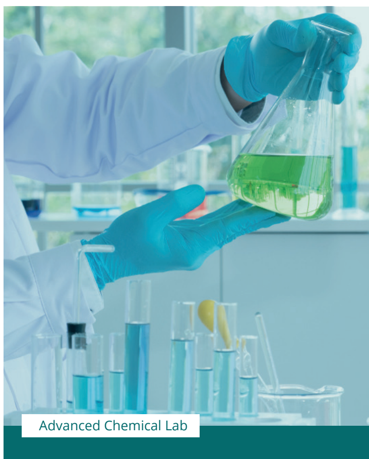
Advanced Chemical Lab

We provide you with reliably effective and user-friendly products. For all medical and nursing areas.